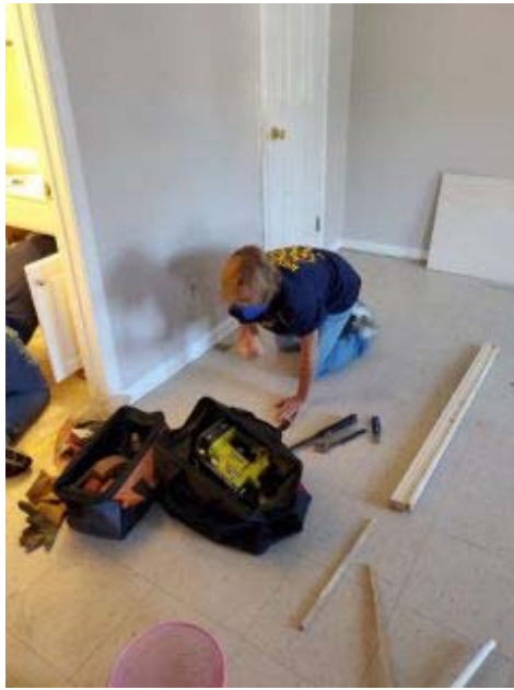
Warwick at City Center Club:

Recently Warwick at City Center's Rotary Club members packed 120 lunches for the Four Oaks Day Center, providing resources for the homeless during the COVID 19 pandemic. Thanks to all of club members who supported this effort!