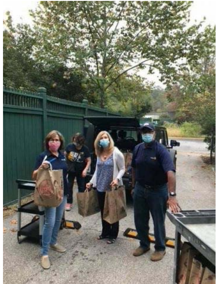
James City County Satellite Club:

Recently Warwick at City Center's Rotary Club members packed 120 lunches for the Four Oaks Day Center, providing resources for the homeless during the COVID 19 pandemic. Thanks to all of club members who supported this effort!