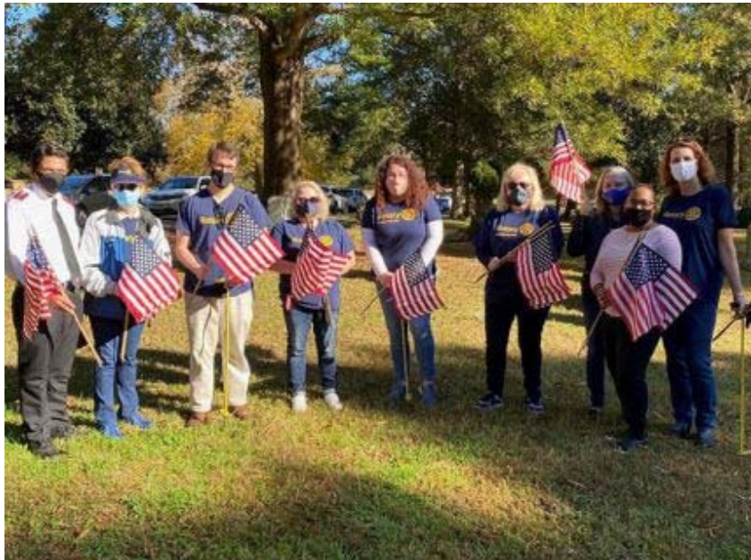
Williamsburg's Cedar Grove Cemetery by volunteers, including the Rotary Satellite Club of James City County, the

Williamsburg Chapter of the Daughters of the American Revolution as well as police officers and firefighters from the city.